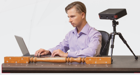
Scanning with markers