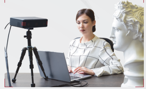
Scanning by geometry