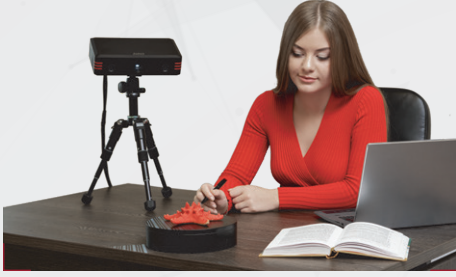
Scanning on a rotary table